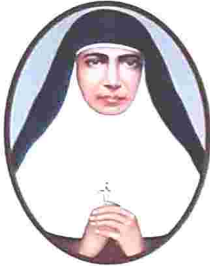
St. Manam Theresia The founder of the Congregation of the Holy Family The Patroness of Families